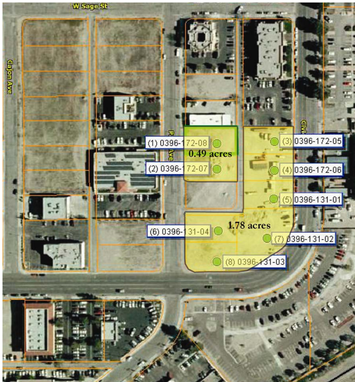
City-owned parcels available for purchase on Park Avenue and Civic Drive in the City of Victorville.

The City of Victorville has eight parcels totaling 2.27 acres available for purchase in the Civic Center area of town. The City-owned parcels are located on Park Avenue and Civic Drive, directly across the street from City Hall and are zoned for commercial use in the high traffic area near Palmdale Road and Interstate-15.