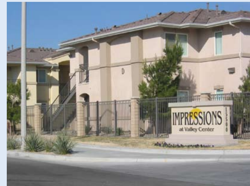
National CORE's development, Impressions in Victorville, CA.

solid housing history and background with projects throughout the Southwest, the developer has now branched out into mixed-use development – leveraging its housing experience with the need to provide retail service to residents. Some of National CORE's mixed use developments are in San Marcos, San Diego and Oceanside. With mixed use developments averaging 5,000-23,000 square feet of retail, National CORE has closed the loop with providing full-service residential and retail developments.