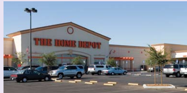
Desert Sky Plaza continues to expand with more retail and restaurant development planned for 2009.

WPI announced plans for a third phase of expansion at Desert Sky Plaza. The additional expansion will be located on the southeast corner of Civic and Roy Rogers Drive. The new phase will encompass approximately 380,000 square feet of retail and restaurant space. WPI has announced that Panda Express, In-N-Out Burger and Walgreens will be locating at the future development.