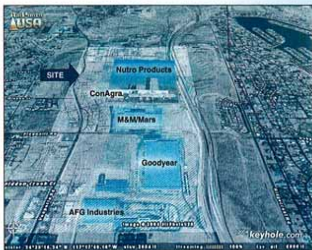
Foxborough Industrial Park

Contact us at opportunities@victorvillecity.com to be removed from our mailing list.