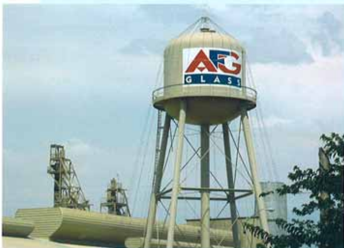
AFG Industries, Victorville, CA

Headquartered in Kingsport, Tennessee, AFG Industries is the nation's largest supplier to the construction/specialty glass market and has the distinction of being the first primary glass manufacturer to have all its manufacturing plants, in both the U.S. and Canada, certified by ISO standards. In 1997, AFG's corporate office obtained ISO 9001 certification—the first glass company worldwide to obtain this certification.